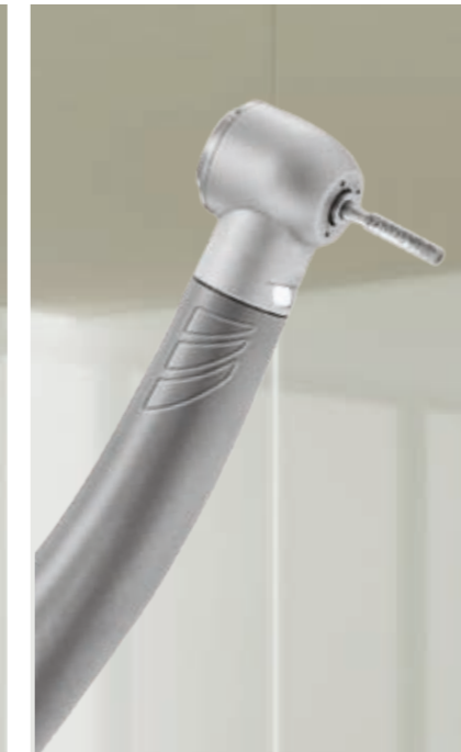
EVO MINIATURE K